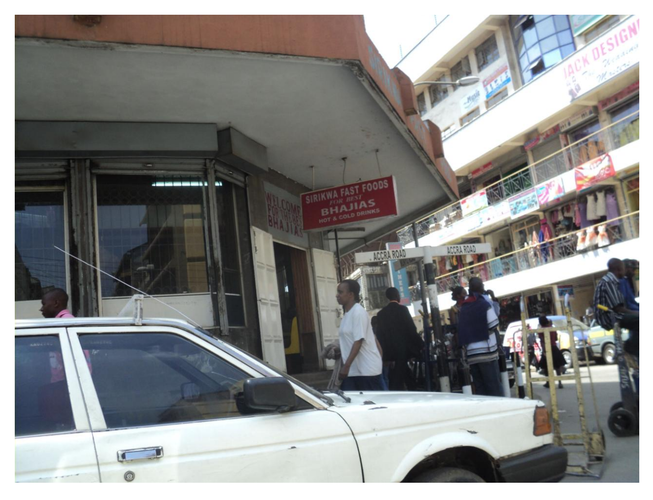
The old premises of Maru bhajia in Reata Road still carries the name