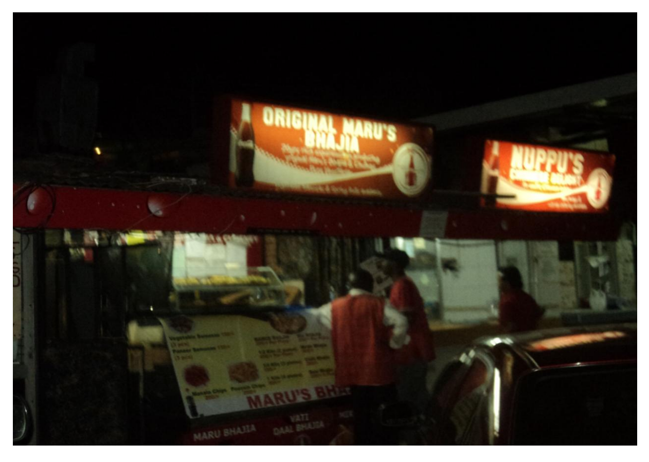
The 'Maru' name is still alive with Bhajia named after him in some Nairobi Malls