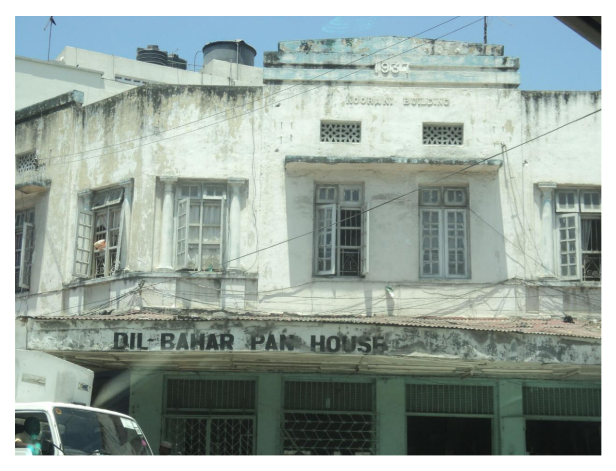
Only the remnants of this old name remains in Mombasa.