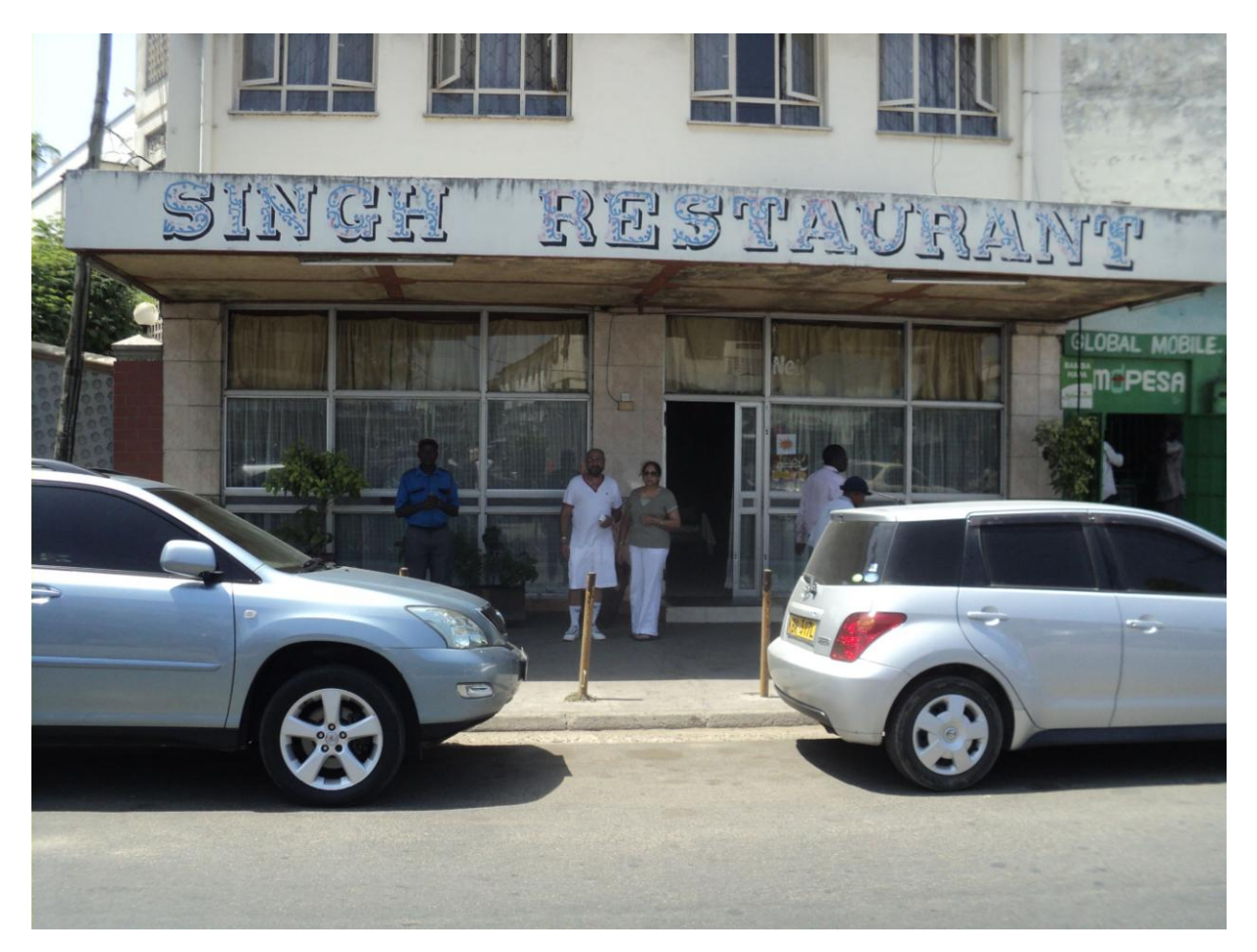
The popular Singh Restaurant in Mombasa-still going strong.

Latema Road where Embassy Cinema, Odeon Cinema used to be with restaurants all galore in the area. Opposite the Embassy, previously known as Green Cinema, used to be Green Hotel and next to it Citizen's Delite.